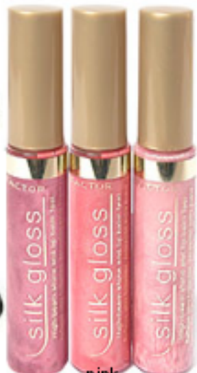
strawberry pink glow crystal