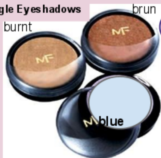
burnt brun blue