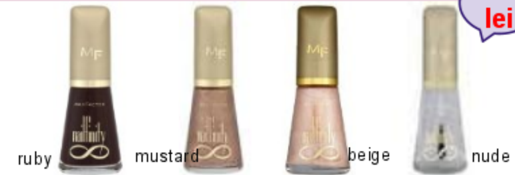
ruby mustard beige nude